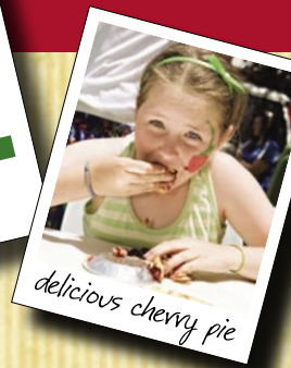
delicious cherry pie