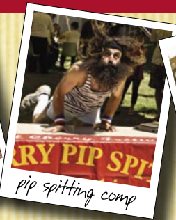
pip spitting comp