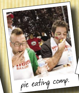
pie eating comp.