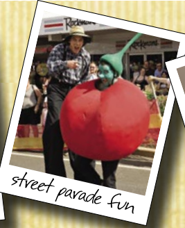
street parade fun